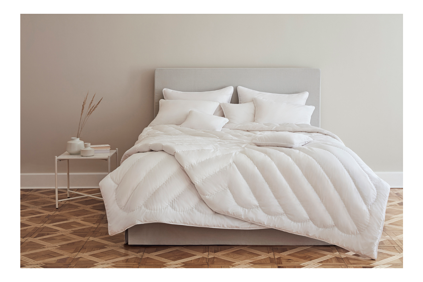
BEDDING MADE FROM REMARKABLE ALPACA FIBRE

To make the very best bedding possible, we decided to combine modern textile knowledge with traditional hand-quilting methods and artisanal attention to detail. Thus, our work preserves and promotes the quality and artistry of meticulous craftsmanship – and makes it available to today's discerning customer.